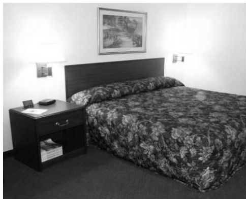
Easily convert smoking to non-smoking rooms

Hundreds of Inns are using ProLimiterator Sunshine to easily convert smoking rooms to non-smoking.